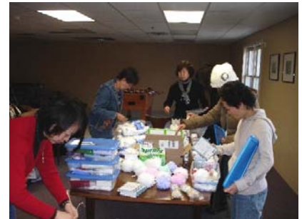
Preparing the Spa Packs