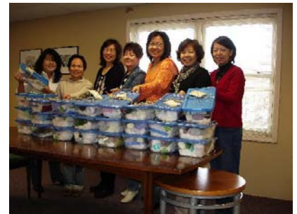
Blessed through Giving